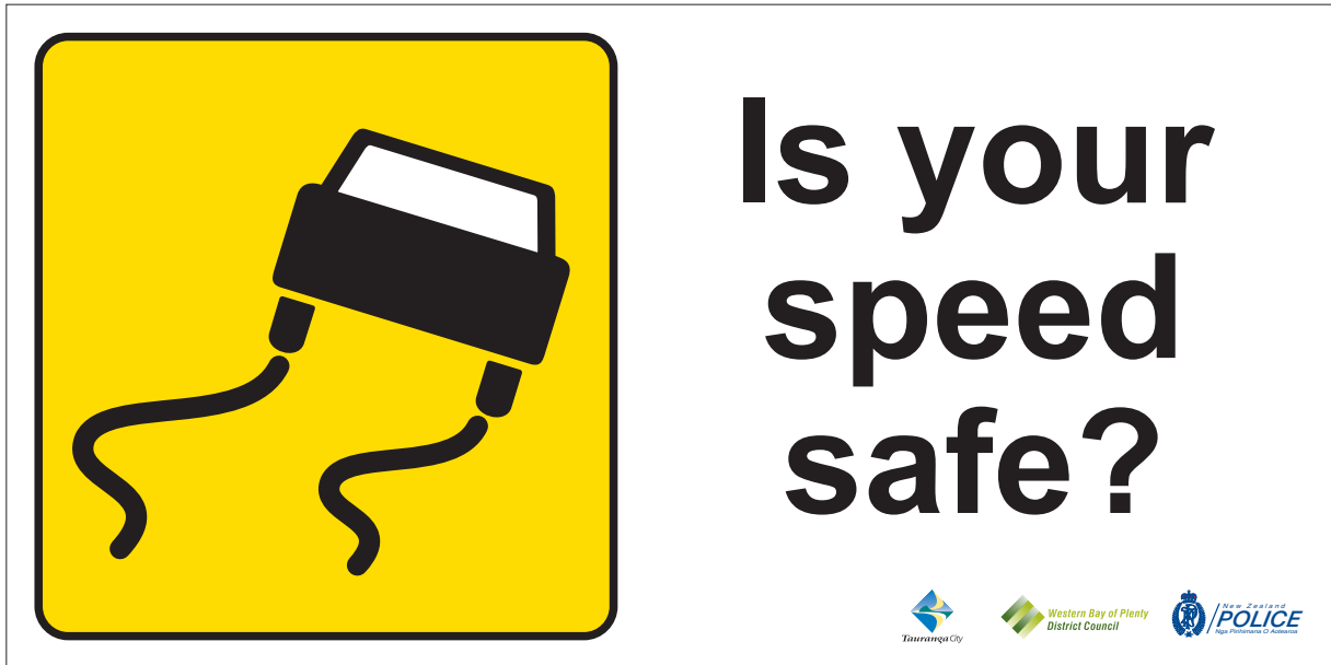
Car Tidy Bag (250mm x 360mm)